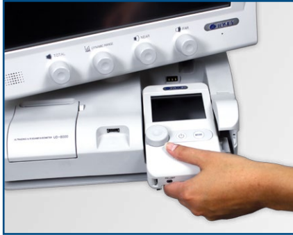
Just dock your AL-4000 to the A/B scanner UD-8000 and you have the ultimate ultrasound workstation.

This extremely handy and easy-to-use combination of Bio and Pachymeter leaves nothing to wish for in terms of comfort and flexibility. Wireless communication plus the fully integrated IOL power calculation software allow for using the complete setup of the handheld device AL-4000 on the PC.