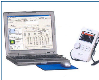
Connectable to Laptop or PC wireless or USB.