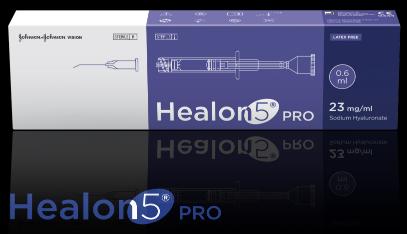
2.3% Sodium hyaluronate