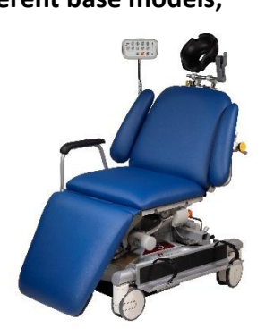
R6 is popular for cataract surgery, IVT eye injections, plastic surgery and similar microsurgical procedures