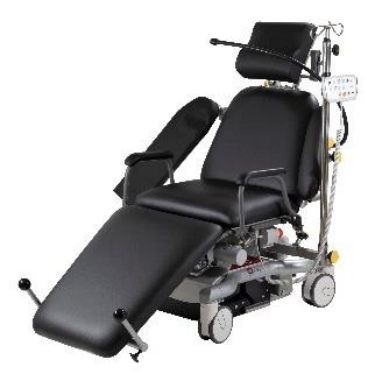
R7 operating table is suited for hospitals and clinics where surgeries under full anaesthesia are performed