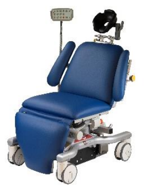
R5 model enable the patient to sit down or stand up from the front of the operating table

Rini's operating tables in the "RiEye"-series are popular for microsurgery in both in stationary use and in "roll-in roll-out" operation. They are easy to handle and have many useful accessories. The stable construction is ergonomically designed to provide a high level of comfort, both for the patient and medical personnel RiEye Mk2S comes in three different base models;