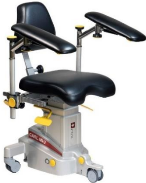
Carl Mk2 Electric chair Electric brake Optional armrests

The chairs have been developed in close collaboration with surgeons in Sweden and internationally and several thousand are in operation worldwide.