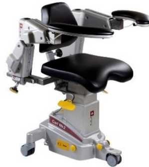
Carl Mk2 R8 Electric chair Electric brake