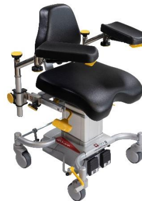
Carl 4 Heel Electric chair Mechanical brake Optional armrests