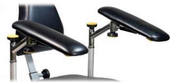
140-00323-01 Cushion soft & rektangular