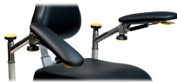
140-00323-00 Cushion soft & convex