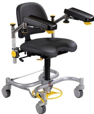
Carl Spring Manual chair Mechanical brake Optional armrests