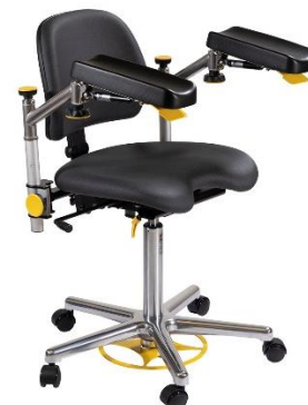
Carl Swing Manual chair Optional armrests