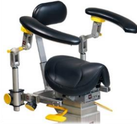
140-00321-02 Saddle seat Amazone When seated higher up. Possible to have small or bigger backcushion