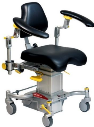
Carl 4 Foot Electric chair Mechanical brake Optional armrests